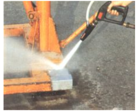
The water-sandblasting head TAIFUN feeds the blasting agent into the high pressure beam so allowing efficient de-rusting, paint removal and abrasive treatment of concrete surfaces, facades, etc.