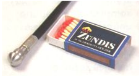
Another new development: The mini rocket set for 40 mm drains.