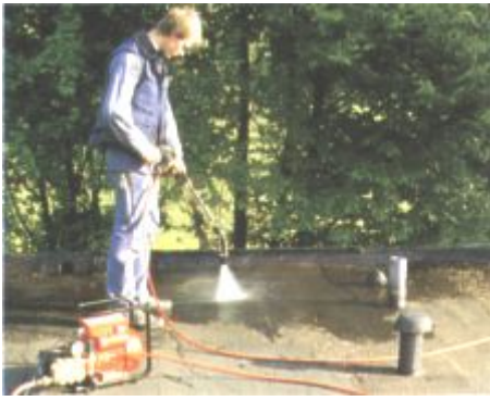
Flat roof restoration? Take the spray device. In order to double the capacity